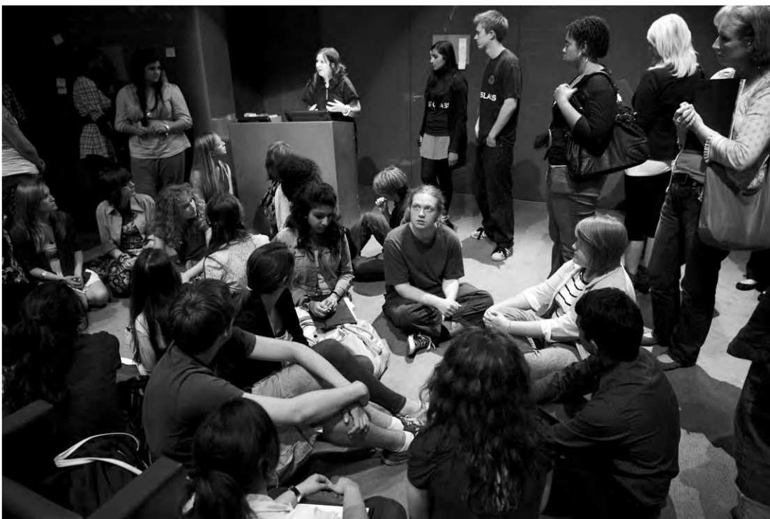
London Anthropology Day 2010 at the British Museum.