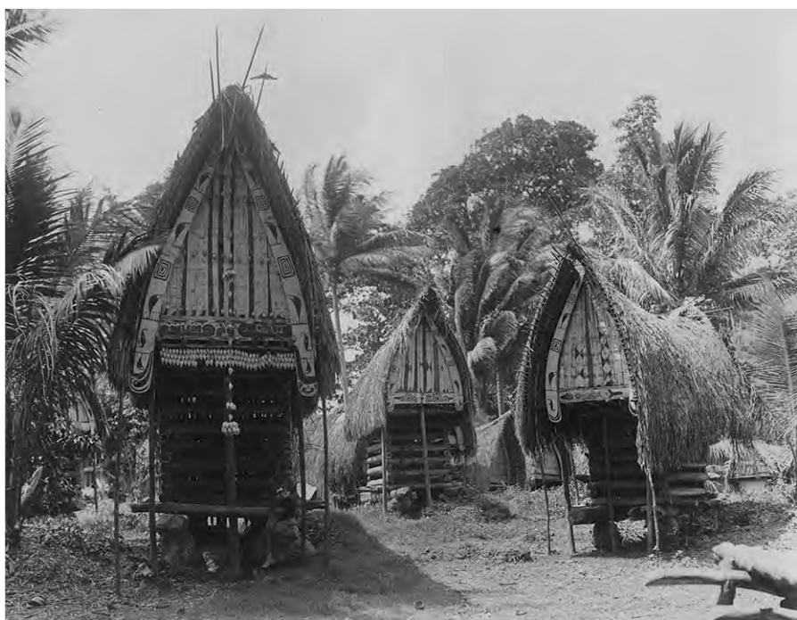
MS 364/2/10/25 Chief's yam houses, Trobriand Islands. C.G. Seligman, c. 1910

A recent highlight has been accreditation of the General Certificate of Education A level qualification in anthropology (for details see page 11). Additional activities in 2010 have included organising the annual London Anthropology Day for school students and teachers held at the British Museum.