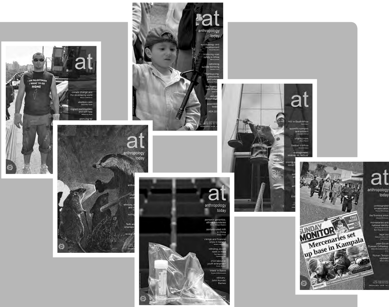
T164.725 he six issues of Anthropology Today Volume 26, 2010

Anthropology Today depends greatly on the anonymous referees, the editorial board, and its freelance consultants and volunteers, who all breathe life into the publication.