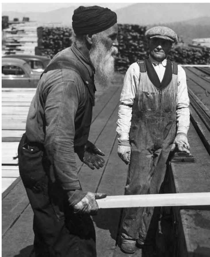
MS 268/15/2/27 Two workers, one wearing turban and overalls, the other a cap and overalls at sawmill.