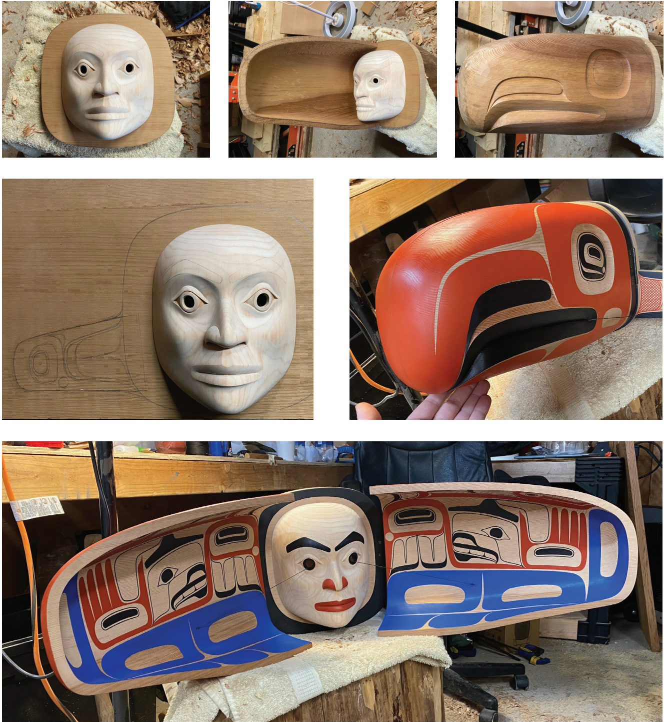
Figure 7 Making process for the Salmon Transformation Mask (Lułootgm Amiiłgm Hoon, ETHAM 068758). Image credit: David Robert Boxley.