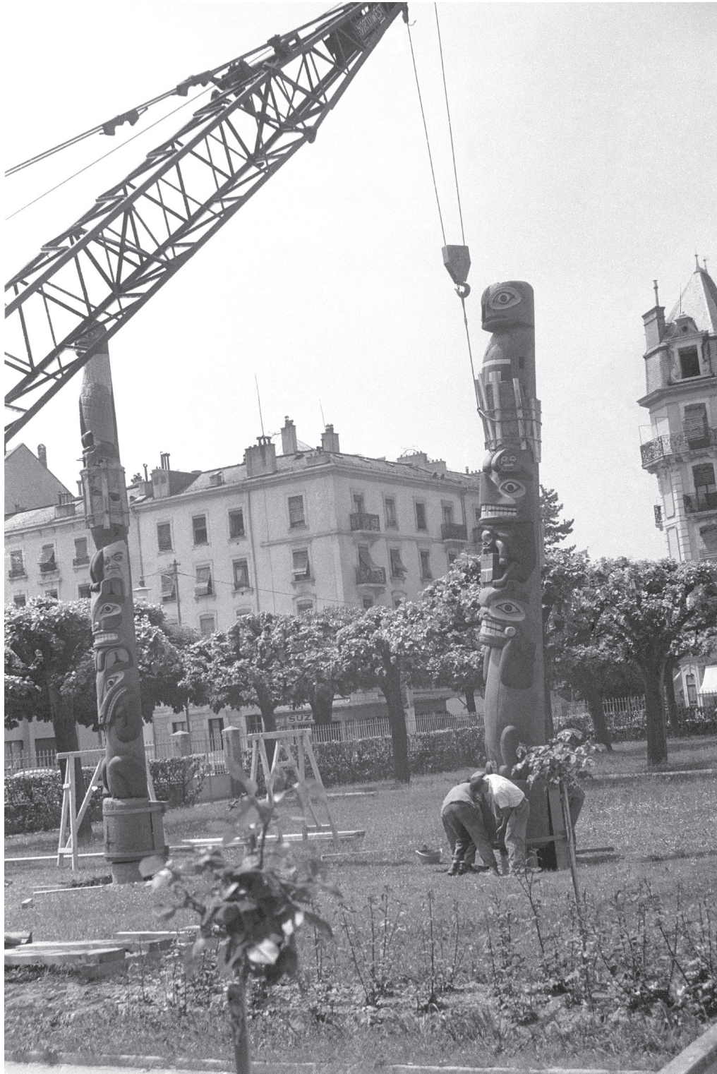
Figure 4 Installation of the totem poles in the Museum's gardens. May 1956.