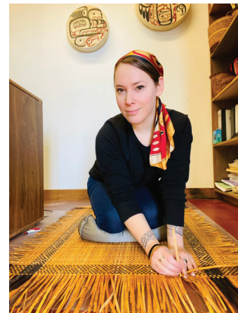
Figure 7 Making process for the cedar offering mat for the salmon (Hoon Umgooksit a Sga'n, ETHAM068768), 2020.

to address the way in which the Ts'msyen community of Metlakatla encourages the creation of a larger pool of fluent speakers as well as adopts a creative approach to engage with and respond to climate change.