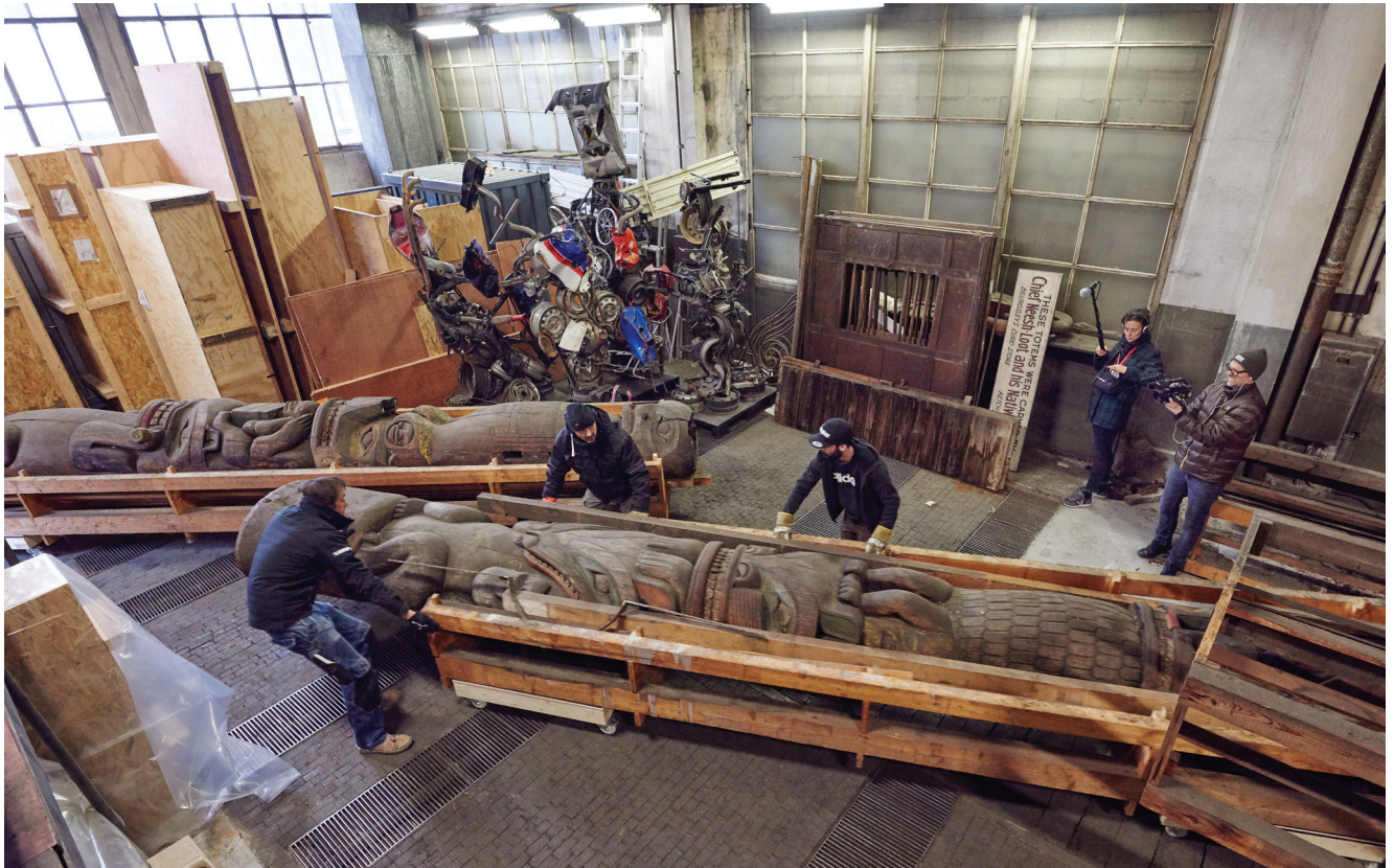
Figure 2 Museum staff repositioning the totem poles side by side to allow conservation study. Image credit: MEG/Carine A. Durand, November 2017.

totem poles he collected for the museum and subsequently brought to Geneva. We became interested in assembling a broad variety of skills, including curatorship, conservation care, photography and film-making for the project. In November 2017 we invited Barbey to record the handling operation that arranged the totem poles side by side, in order to allow the commissioned conservator to perform the conservation study.