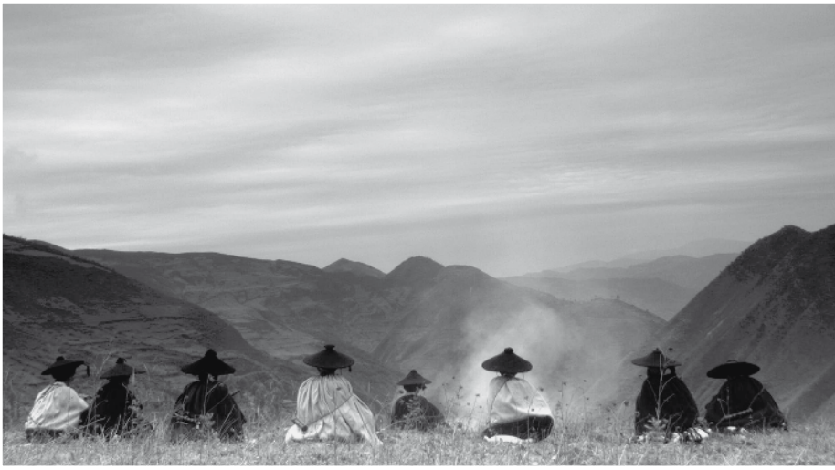
Cover image: The Bimo Records', shot by Yang Rui, in the Dailiang Mountains of Sichuan, China in 2006; commendation for the Basil Wright Film Prize 2007