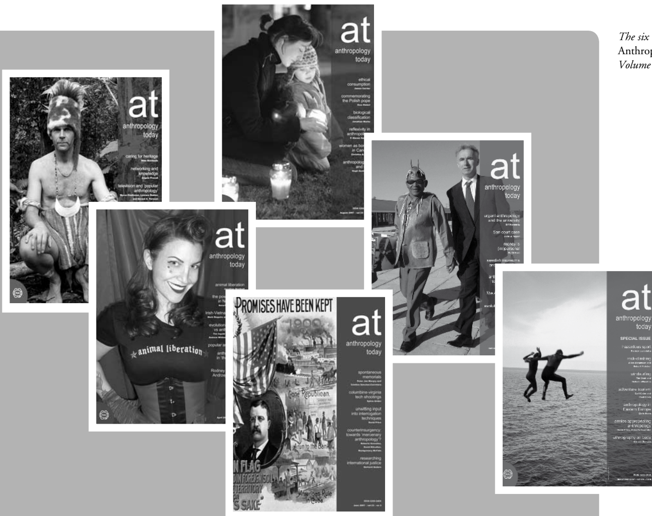
The six issues of Anthropology Today Volume 23, 2007

Topical themes addressed during the year included: the San landrights courtcase, ethical consumption, popular Dutch television, ethnography on beds, memorializing death, the Columbine massacre, mourning Pope John Paul II, money and credit, animal liberation and rights, the International Criminal Court, evolutionary biology, the FM 2-23 Counterinsurgency Manual, the ESRC counter-terrorism research project, the issue of torture and unwitting research for the CIA. In line with emphasis on debate, a large proportion of contributions related to previously published items. Anthropology Today achieved an increase of over 5% in the number of institutional subscriptions during the year (from 3627 to 3810 institutions, including combined subscriptions with the JRAI ). An additional 2665 institutions gained access through licensed databases. Online readership increased by an estimated 23%. Anthropology Today depends greatly on the anonymous referees, its team of freelance consultants and volunteers, and the editorial board, who all breathe life into the publication.