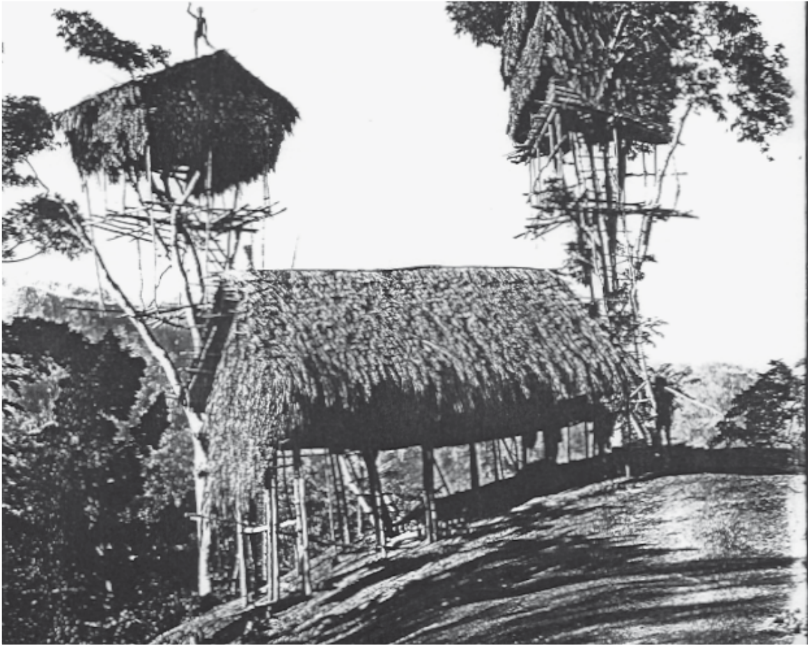
Papua New Guinea. Photograph by F.W. Barton, c. 1904. (RAI 20248).