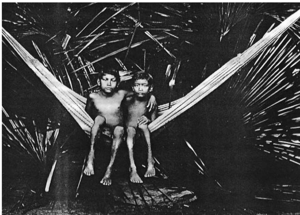
Carib boys, Guyana.

The RAI records its thanks to the Diana, Princess of Wales Memorial Fund for financial support; and to Brunel University for hosting the Centre and providing generous facilities.