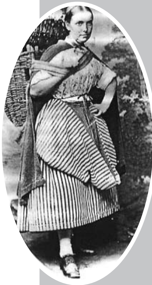
A Fishwife from Newhaven, near Edinburgh.