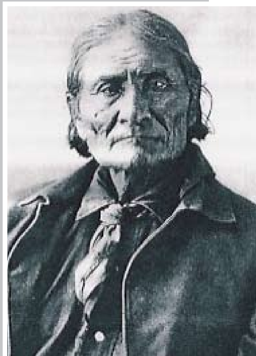
Geronimo. Photograph by F.A Rinehart, 1898. (RAI 5866).

Various improvements have been or are in the progress of being made to the conservation of the Photographic Collection. Funds are being sought to make more of it available via an expanded web site. This web site is intended to include the collection's catalogue, organised by geographical regions and areas as well as by photographer's name. It is hoped that various photographic images from the collection will eventually be accessible to a worldwide audience on-line.