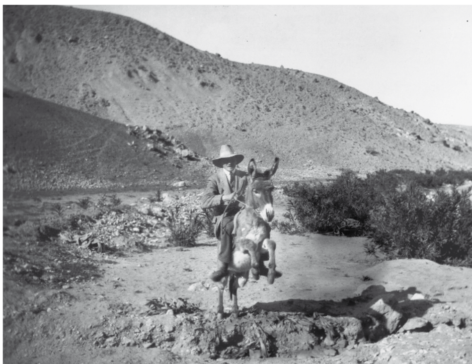
M. W. Hilton Simpson on a mule, El Kantara. Photograph by Hilton Simpson, 1920-21. (RAI 9338).

Highlights of 2000 included features on the following themes: the Middle East; Greek narratives of war in Kosovo; the GM debate; sewing machines among the Maya; the public face of anthropology; civil society; the anthropology of Britain; public Islam in Egypt; India's affirmative action policy; Malinowski's tent; the military and the Nuer in Sudan; geneticism in popular discourse; selectionism; young people 'in trouble' and ideas about 'childhood'; the exhibition on recycling at the Pitt Rivers Museum; the notion of 'indigenous peoples' rights'; returning to Tuareg as an elder; political controversy over 'primitive art' in the Louvre; shepherders and tourism in France; Palestinian and Israeli tourism in Hebron; Aboriginal reconciliation; a critique of 'cognitive' development anthropology; (de)privatisation of religion in Poland and Turkey; review of the North American Exhibition at the British Museum; and the role of 'indigenous knowledge' in development.