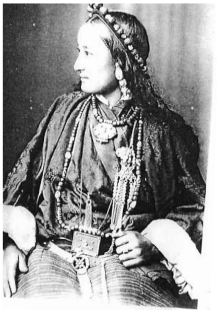
Tibetan woman from Tashi-Lumpo.

The Wellcome Medal for Anthropology as applied to Medical Problems is awarded in alternate years following the recommendation of specialist expert judges. Announcement of the 2000 award will be made in late 2001.