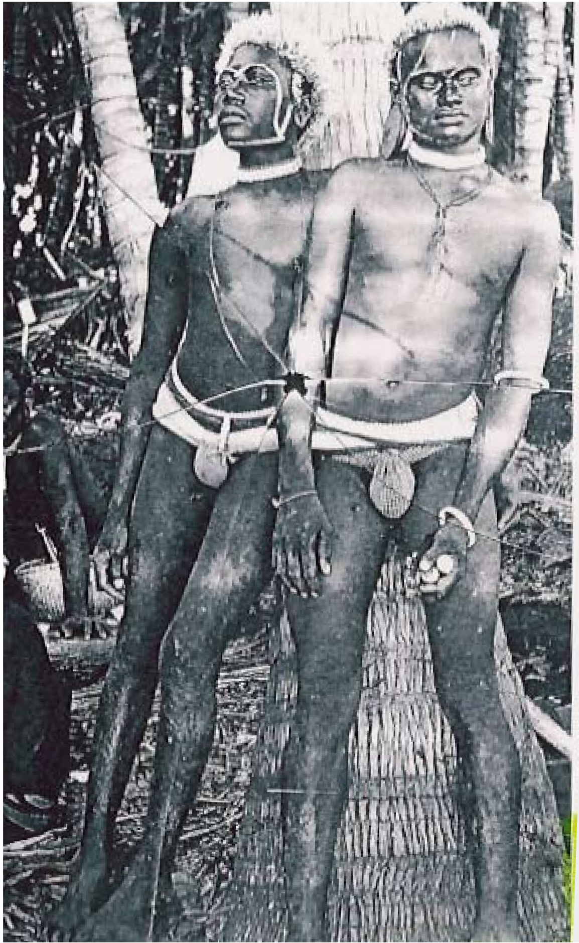
New Georgian youths, Solomon Islands. Photograph by Lieutenant H. T. B. Somerville, 1893-4. (RAI 1773).