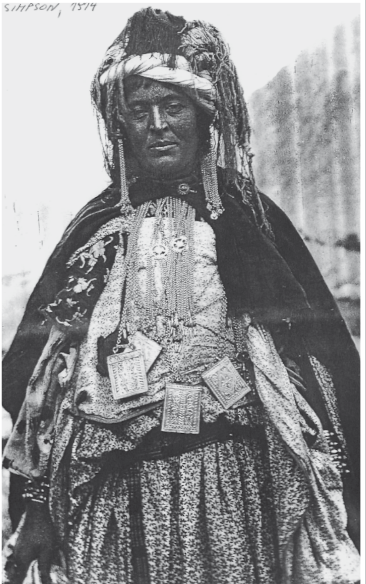
Algia out fiala, Auresian woman, (Eastern Algeria). Photograph by M.W. Hilton Simpson 1914. (RAI 8802).