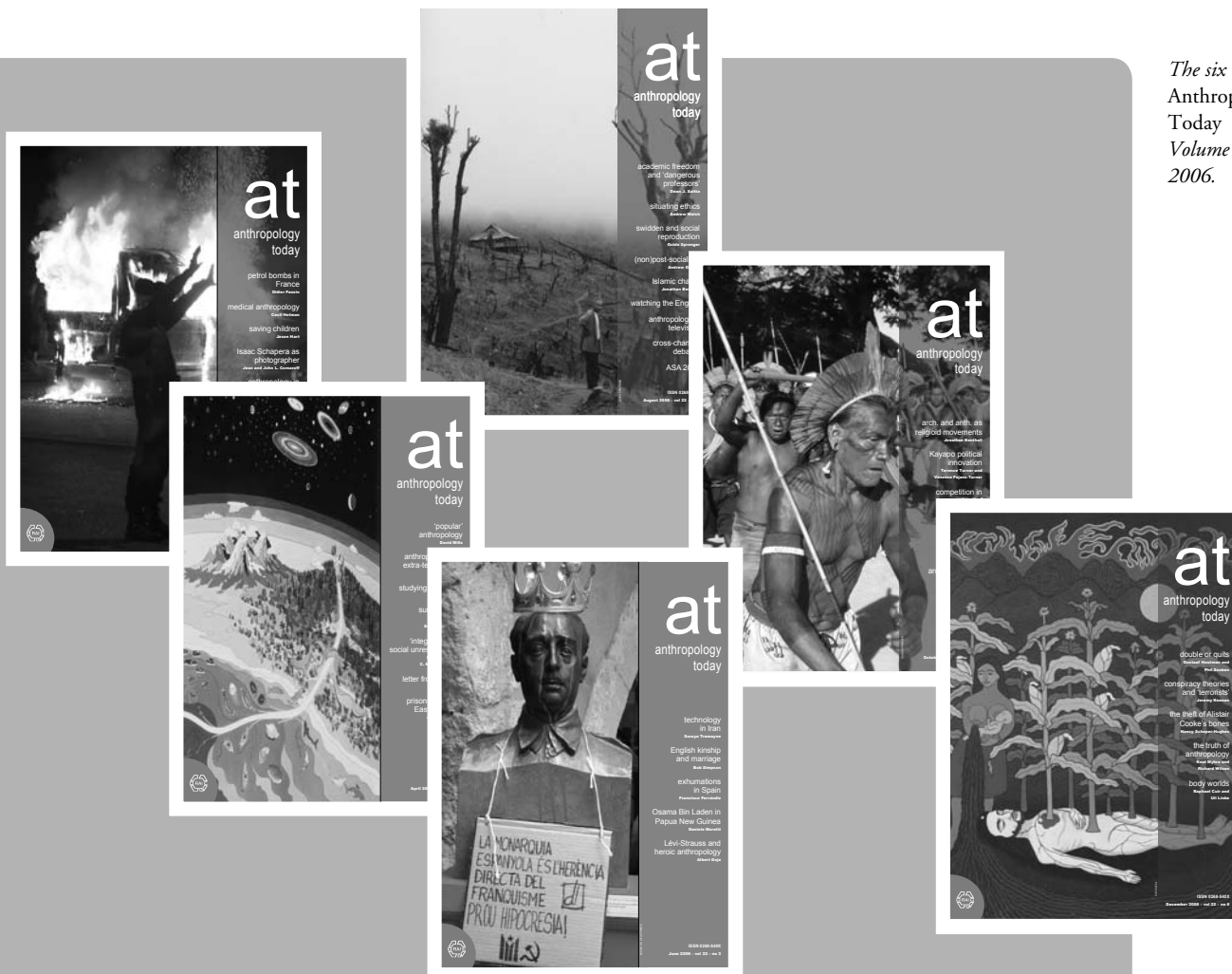
The six issues of Anthropology Today Volume 22, 2006.

Anthropology Today depends greatly on the anonymous referees, its team of freelance consultants and volunteers, and to the editorial board, who all breathe life into the publication.