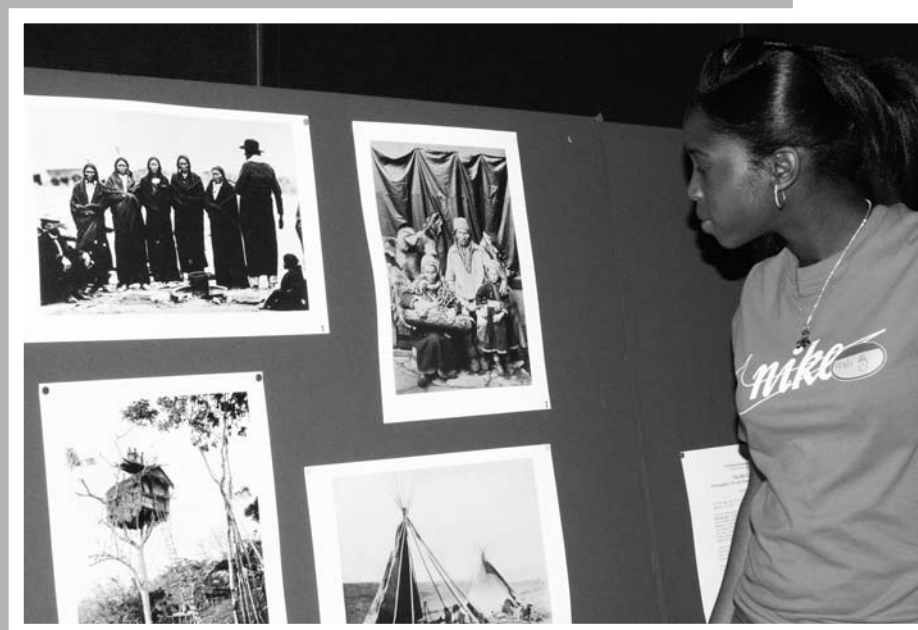
An exhibition of RAI archival photographs at the London Anthropology Day.