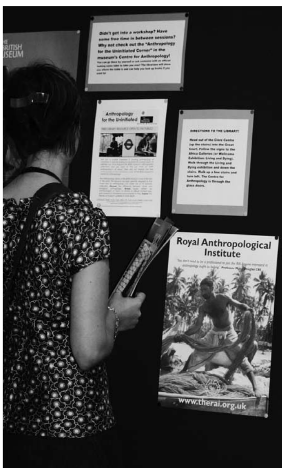
Pre-university student finding out about the RAI at the London Anthropology Day.

For more information on joining the RAI and current fees, visit the RAI website at www.therai.org.uk , and follow links to the Blackwell Publishing website.