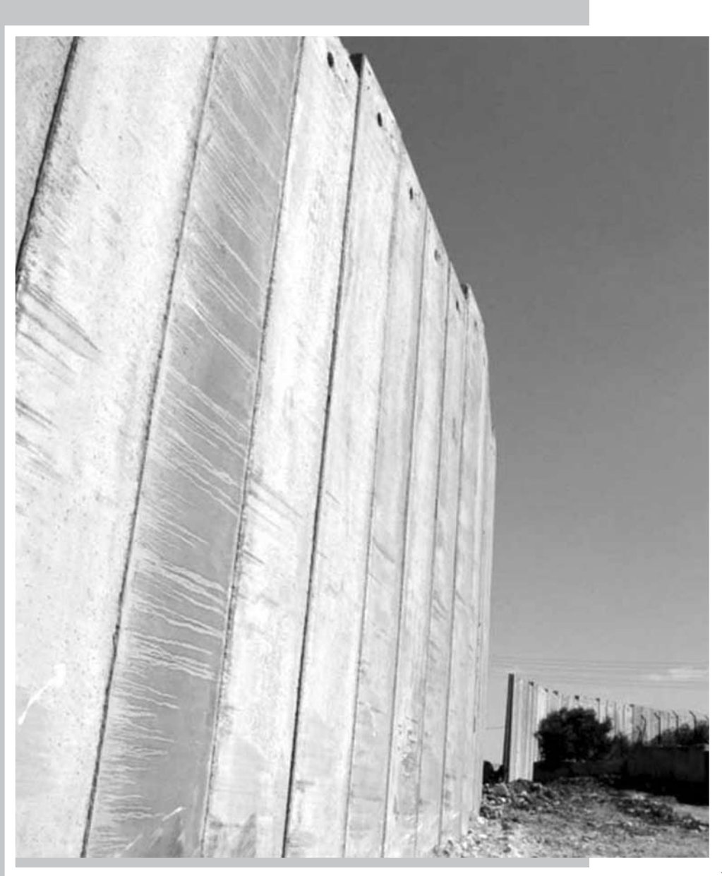
One view of the Wall at Bethlehem.

The video holdings now form part of the combined RAI Collection (see page 10). A number of important new titles have been added in 2004, and international links with partners in ethnographic film, in continental Europe and beyond, have been strengthened. The highlight of the Committee's activities is the organisation of the biennial RAI International Festival of Ethnographic Film, a major event in the international calendar of documentary film. The ninth Festival will be held in 2005 at Oxford University.