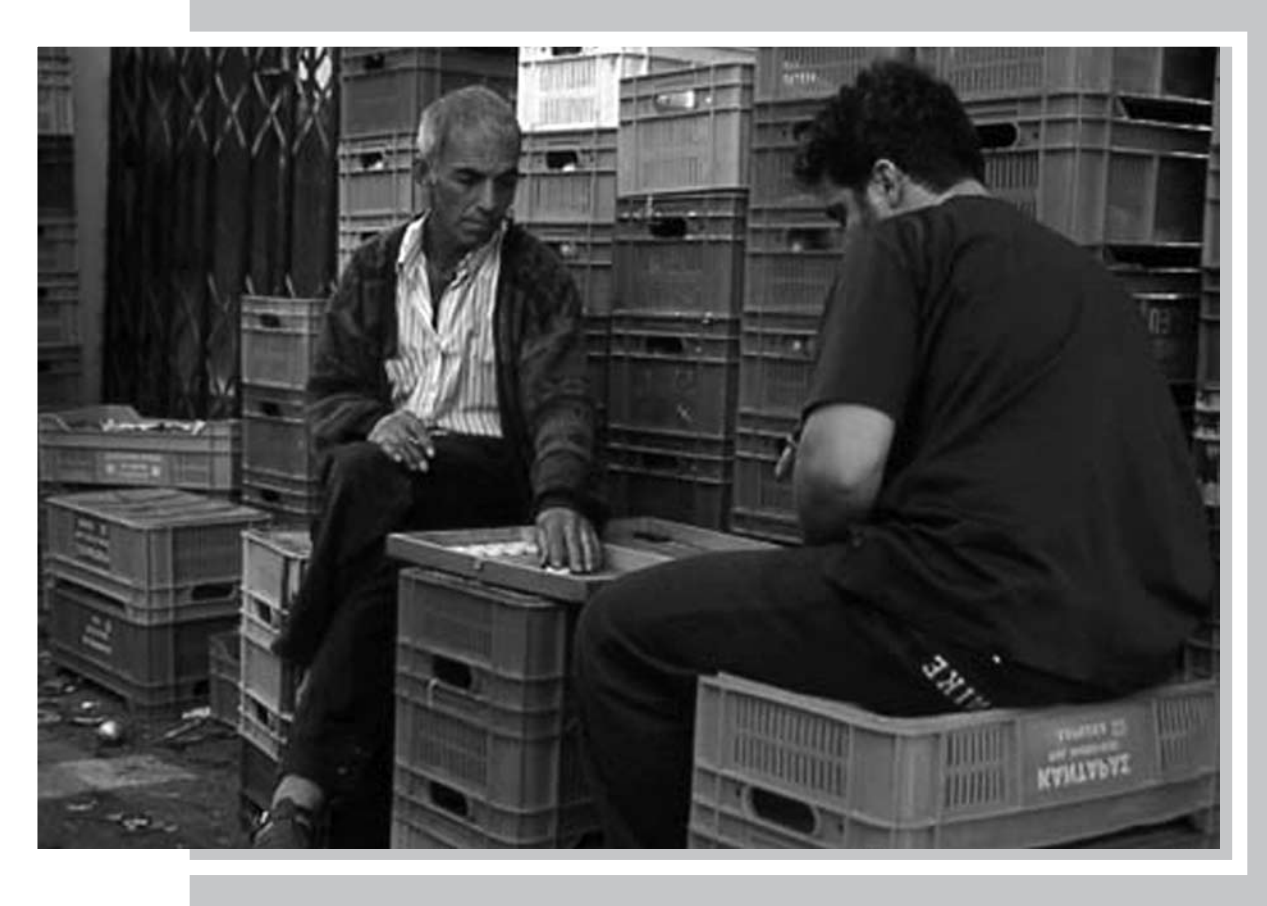
Playing blackgammon in the market place, south Nicosia.