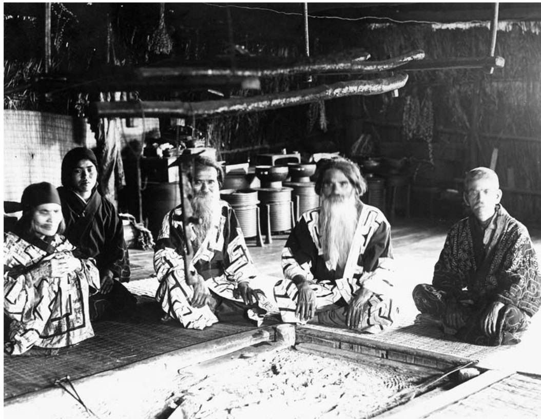
Photograph of an Ainu interior. Inside the house, the householder is sitting at the north-east corner of the hearth with the pothook hanging beside him. c. 1930.