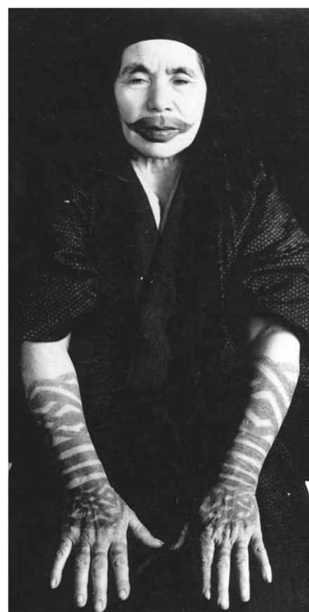
Photograph of a Tusu or medium with tattoos around her lips and on her arms.