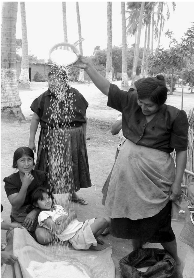
Women gathered to 'ventear' or to aerate the rice right after it is harvested – Caserio de la Pampa de los Silva. Catacaos, Piura, Peru. Oct. 2004.

The photo collection now forms part of the combined RAI Collection; see page 11 for a report on Collection activities in 2005.