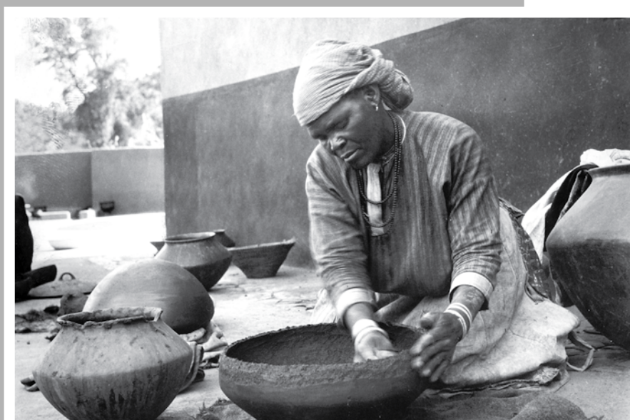
Woman making pot. Photograph by I. Schapera, (RAI3880). © Royal Anthropological Institute of Great Britain and Ireland.

Anthropology is not currently taught as a distinct discipline at pre-University level in the UK, with the exception of an optional course within the International Baccalauréate. The curricular strand of the education programme seeks to develop a presence for anthropology within school and FE curricula. The emphasis during 2008 has been on developing a structure and content for an A level qualification in anthropology. Throughout 2008 the RAI has worked in partnership with the awarding body AQA to develop the A level, which has been submitted for accreditation by the Qualifications and Curriculum Authority.