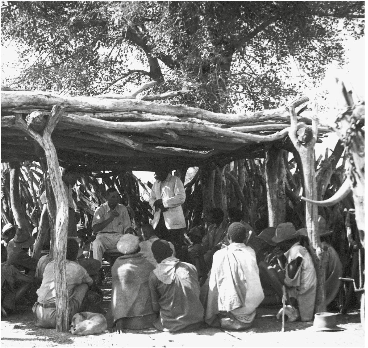
Stock inspector addressing men of Morwa village at the time of foot and mouth disease.