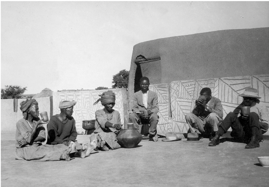
Cover image: Informal beer-drinking; the two central figures, husband and wife, entertain guests. Photograph by I. Schapera, (RAI4040). © Royal Anthropological Institute of Great Britain and Ireland.