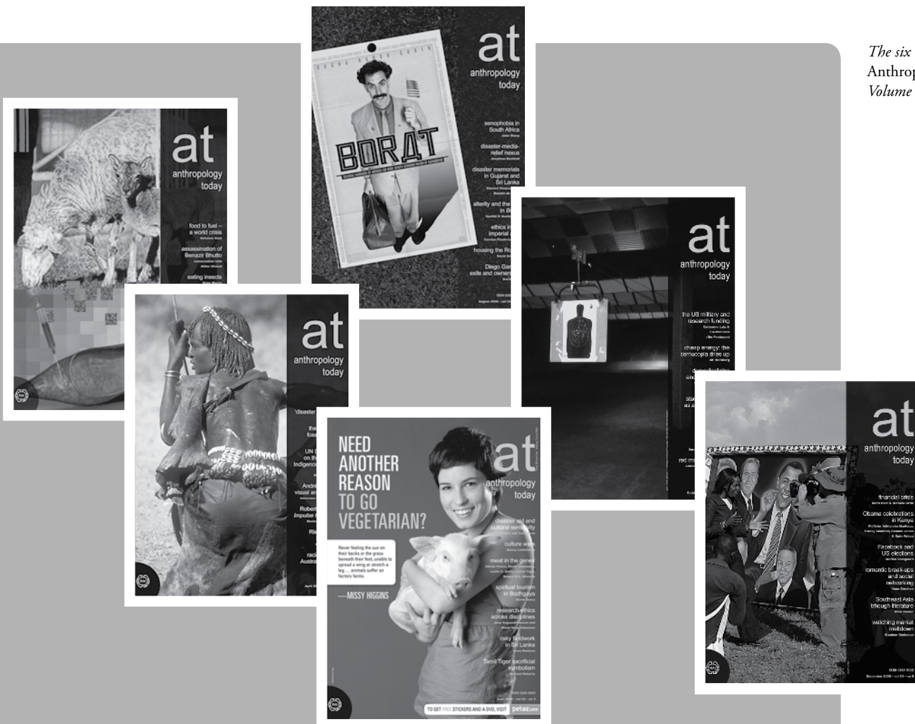
The six issues of Anthropology Today Volume 24, 2008

themes addressed during the year included: fuel and the world food crisis, assassination of Benazir Bhutto, Human Terrain, cloning, UN Declaration on the Rights of Indigenous Peoples, visual anthropology, baseball, cricket, Australian red meat advertising campaign, torture, disaster aid, Diego Garcia and the Chagos Islanders, Borat, violence in South Africa, AFRICOM, Minerva, the financial crisis, Obama elections in Kenya and on Facebook. In line with emphasis on debate, a large proportion of contributions related to previously published items. Anthropology Today depends greatly on the anonymous referees, the editorial board, and its freelance consultants and volunteers, who all breathe life into the publication.